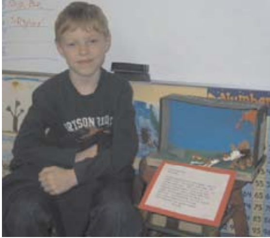
Hummingbirds By Caleb

Hummingbirds have to get spider webs to make a nest. The mother lays eggs, out comes baby birds. They say, "ch...ch...ch." The mom feeds them. They grow fast. They get nectar from a flower with their beak. Hummingbirds are as big as a butterfly. Hummingbirds' favorite color is red. Hummingbirds are 3 inches. Hummingbirds are good smellers. The end