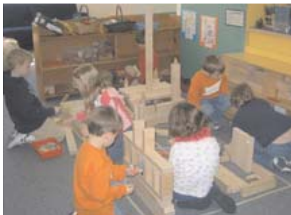
More block building....the details.