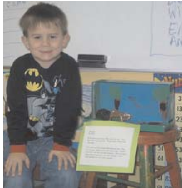
Wolves By Will

Hummingbirds have to get spider webs to make a nest. The mother lays eggs, out comes baby birds. They say, "ch...ch...ch." The mom feeds them. They grow fast. They get nectar from a flower with their beak. Hummingbirds are as big as a butterfly. Hummingbirds' favorite color is red. Hummingbirds are 3 inches. Hummingbirds are good smellers. The end