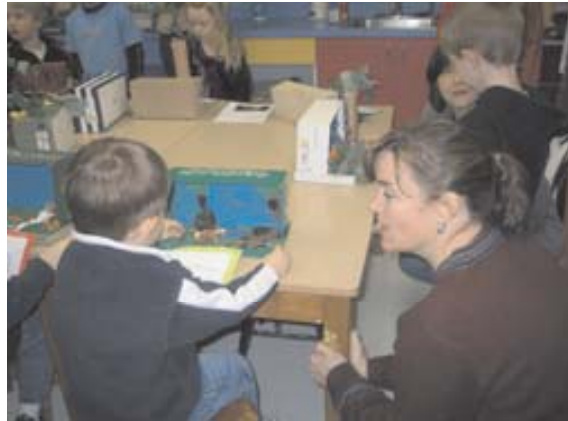
Primary students share projects and answer questions.