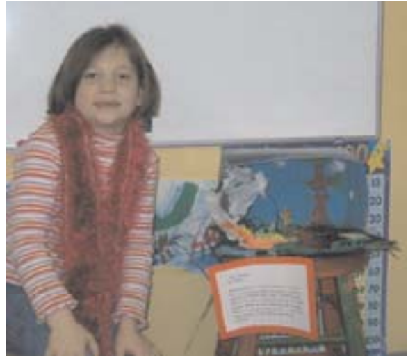
I love Horses By Andrea

Tigers are the biggest cats. They can run 30 miles an hour and jump across a classroom in one leap.