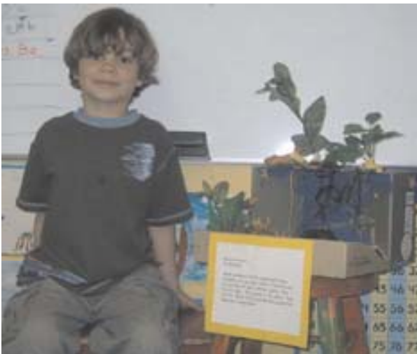
Black Panthers By Brendan

Wild horses live in North America. Horses eat grass. Horses drink between 10 and 20 gallons of water every day. Horses nuzzle when they love. Groups of horses are called bands. When a mare wenders off it means that it is going to have a baby. A foul is a baby horse. A fowl drinks out of her mommy.