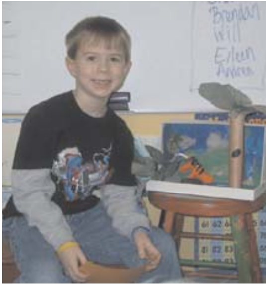
About Tigers By Charlie

I like tigers a lot. Tigers are big cats. They are orange with black stripes but their tails are white with black stripes.