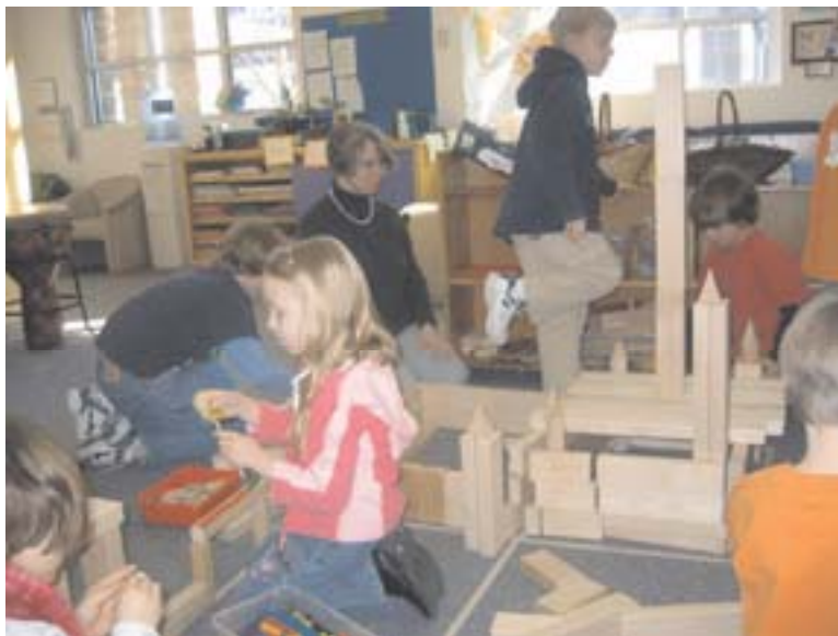
Block building....a city emerges.